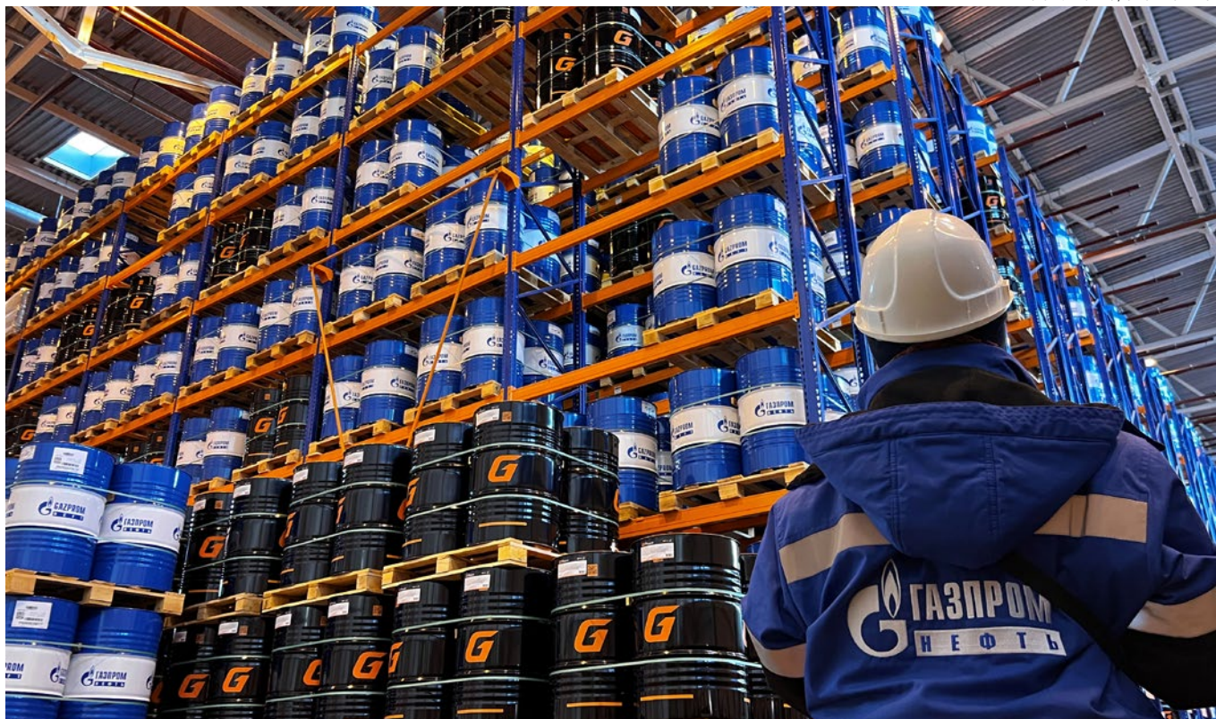
An employee works at Gazprom Neft's lubricant plant in Omsk (2022).