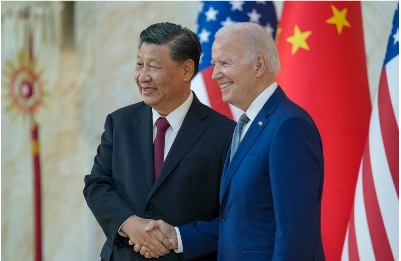
US President Joe Biden shakes hands with Chinese President Xi Jinping on the sidelines of the G20 leaders' summit in Bali (2022).

composition of US–China bilateral trade has also shifted away from goods with the highest tariffs.