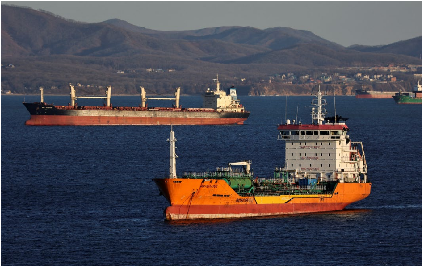
Oil tankers and shipping vessels sail near the port city of Nakhodka, Russia (December, 2022).