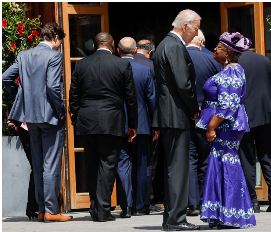
US President Joe Biden and World Trade Organization Director-General Ngozi Okonjo-Iweala speak as G7 leaders as enter the Schloss Elmau castle in the Bavarian Alps during the 48th G7 summit (2022).