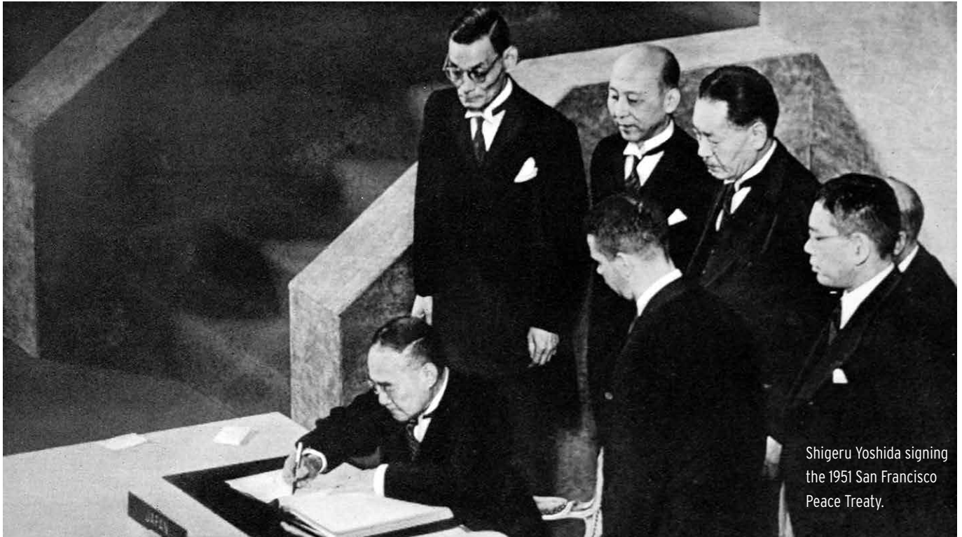
Shigeru Yoshida signing the 1951 San Francisco Peace Treaty.