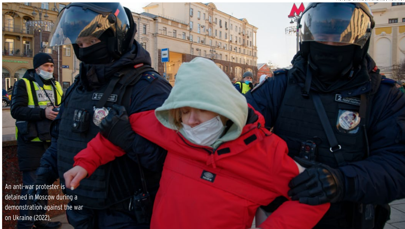
An anti-war protester is detained in Moscow during a demonstration against the war on Ukraine (2022).