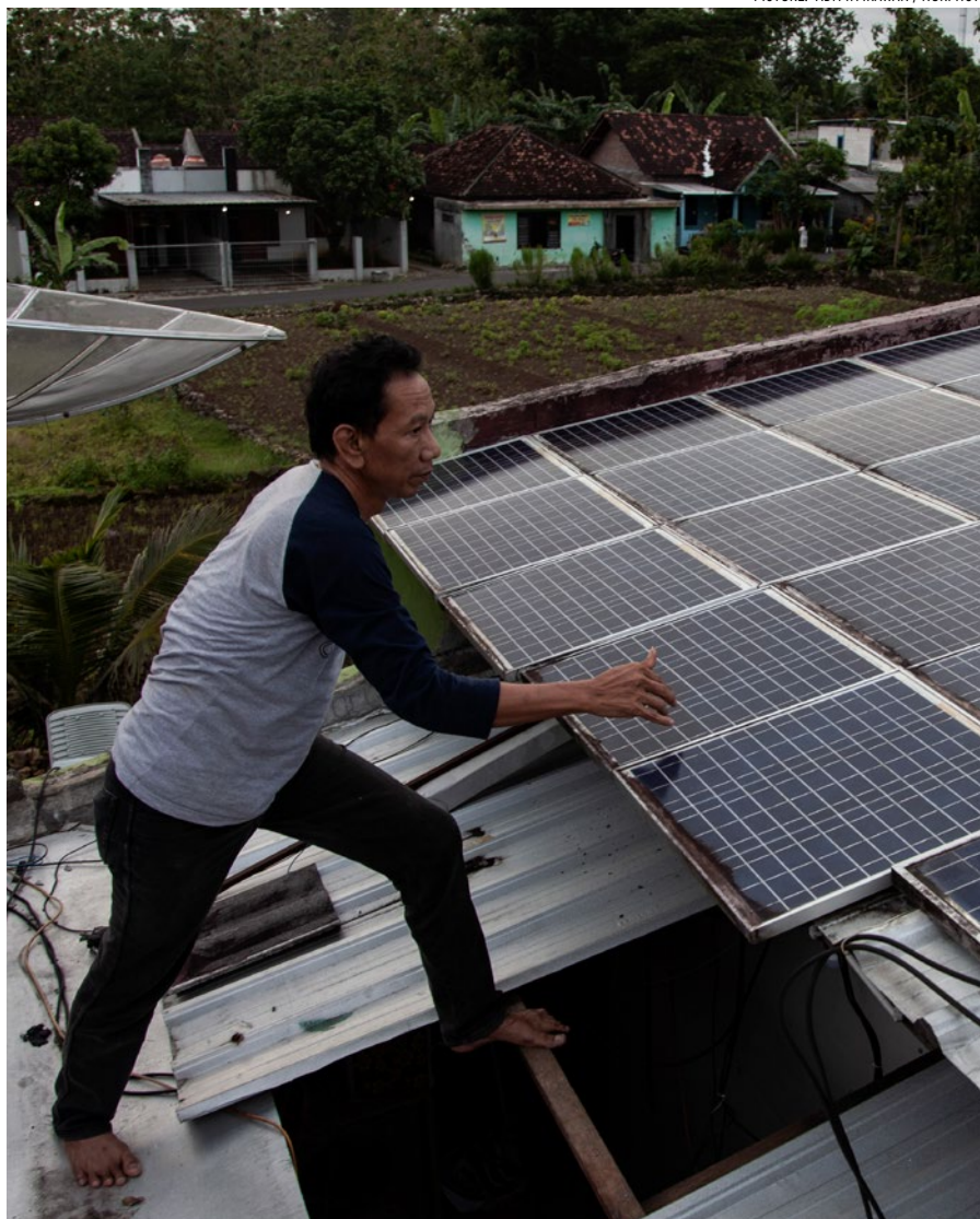
A campaigner for energy transformation in Indonesia is pictured with the solar panels installed at his home in Special Region of Yogyakarta (2022).