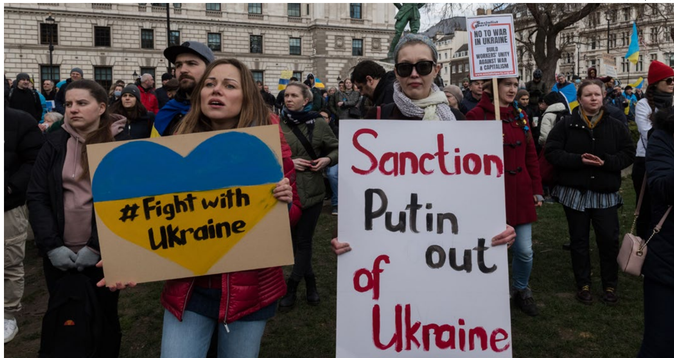
Protestors in London demand the supply of air defence and anti-missile systems, implementation of further sanctions including bans on energy trade, exclusion of all Russian banks from the SWIFT payment network and help for refugees on the 11th day of Russian invasion of Ukraine (March 2022).

freezing Russian assets—such as the foreign exchange reserves held by the Russian Central Bank in foreign central banks—and the expulsion of Russian banks from the SWIFT interbank network. Major restrictions on goods and services trade were also imposed.