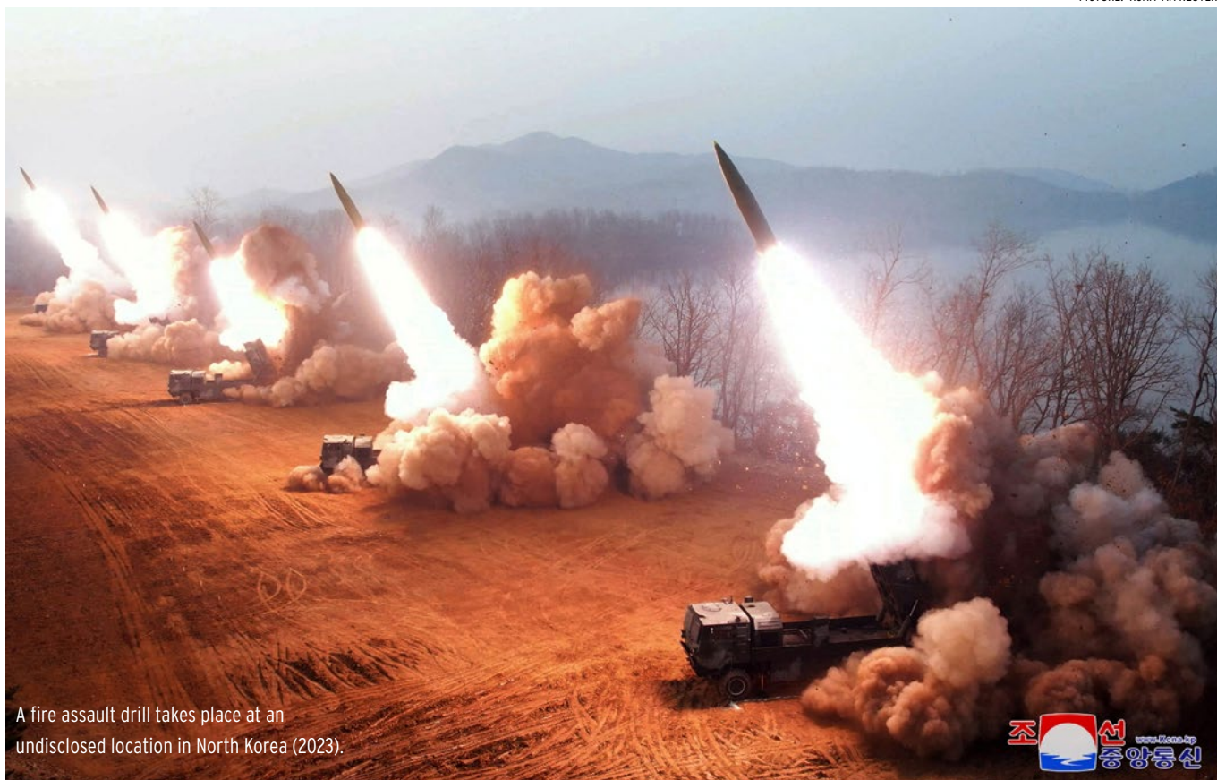
A fire assault drill takes place at an undisclosed location in North Korea (2023).