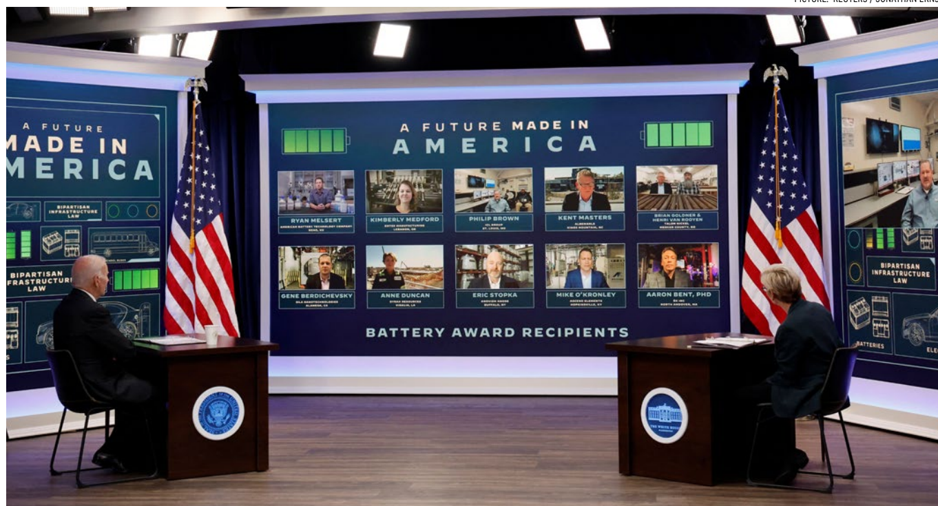
US President Joe Biden and Energy Secretary Jennifer Granholm attend a video conference for electric battery industry grant winners (Washington DC, 2022).