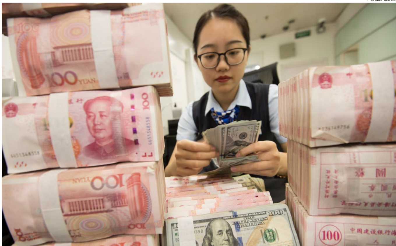
A Chinese clerk counts US dollar notes over RMB yuan notes at a bank in Hai'an city (2019).