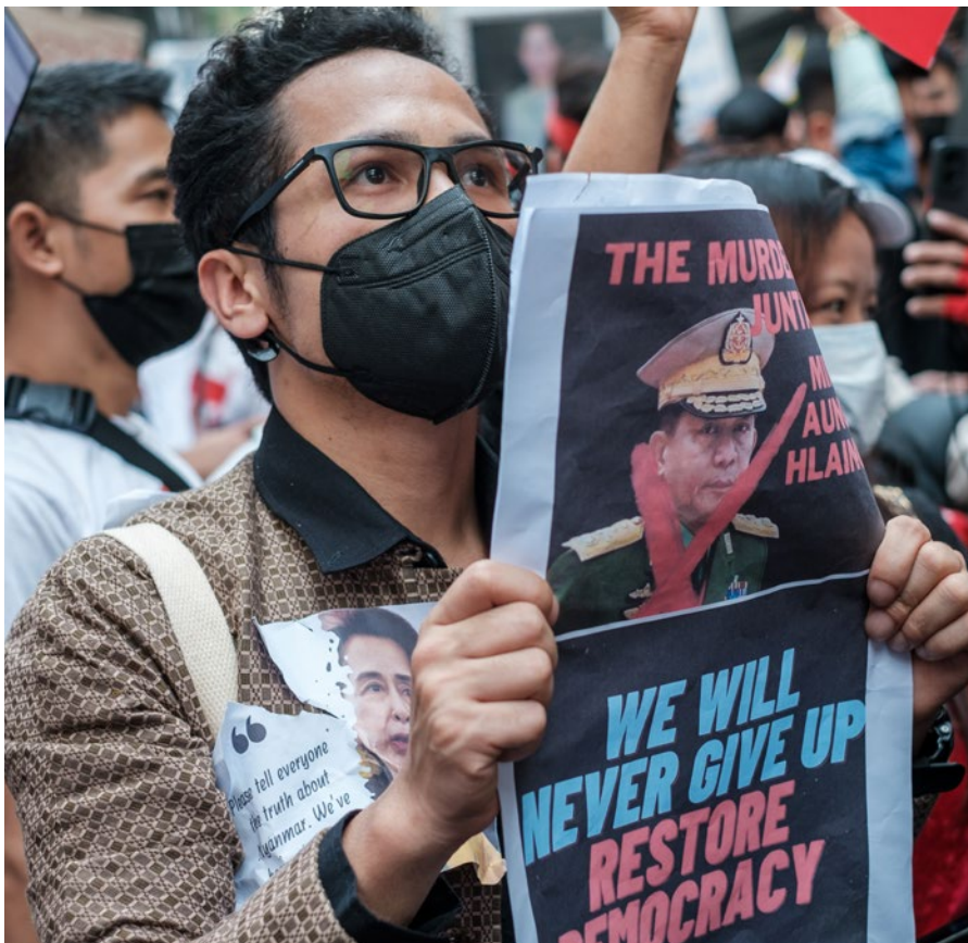
A protester holds up a pro-democracy sign at a protest at the Myanmar Embassy in Bangkok (2023).