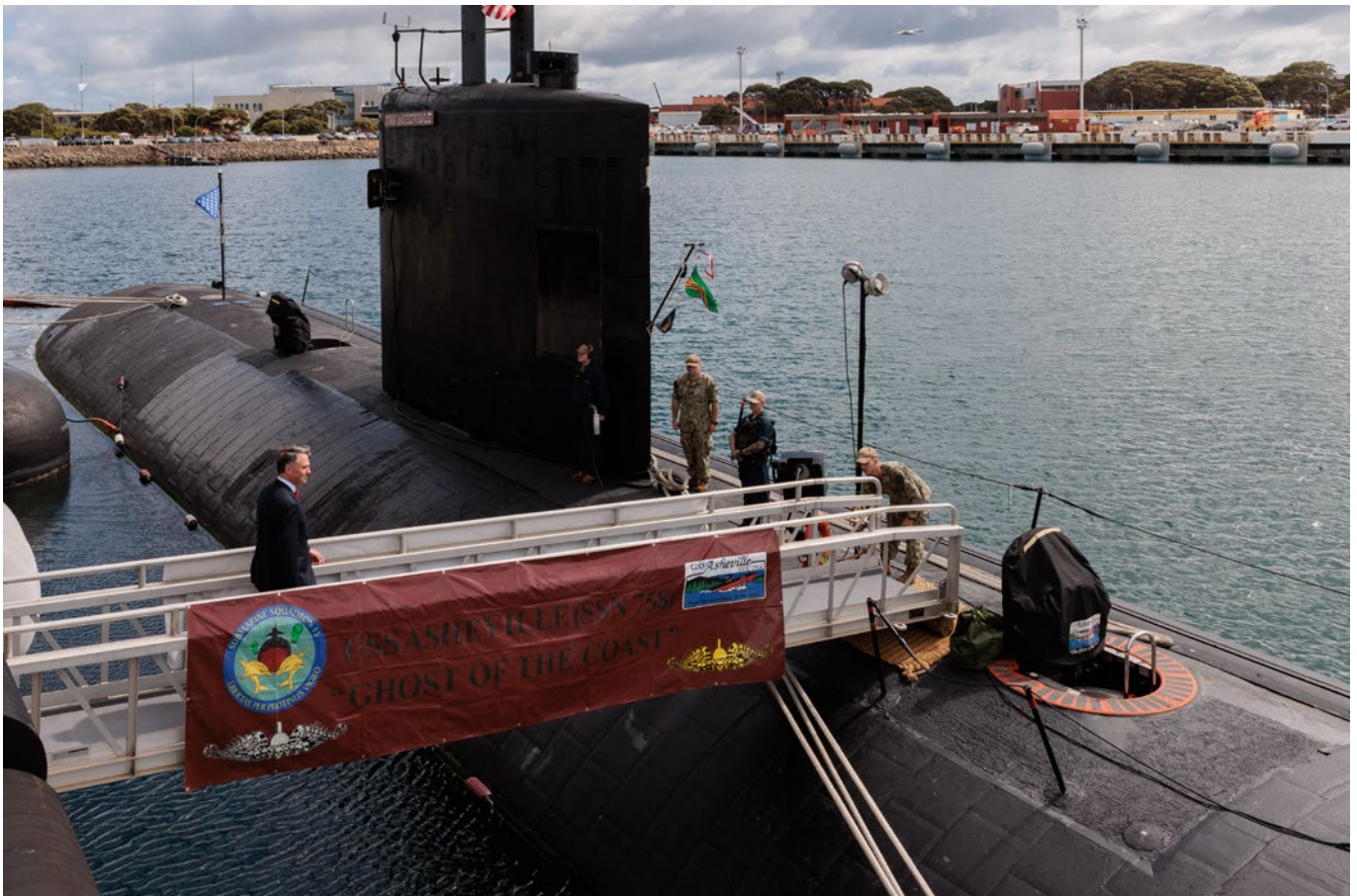
Australian Minister for Defence Richard Marles boards the USS Asheville , a Los Angeles-class nuclear powered fast attack submarine (Perth, 2023).