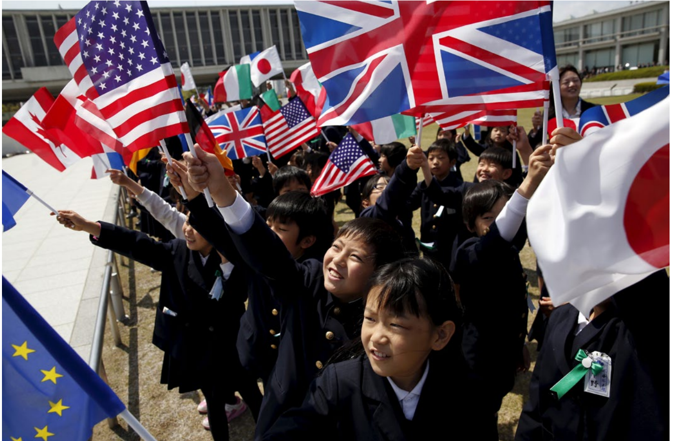
Children raise flags to mark a visit by G7 foreign ministers to the Hiroshima Peace Memorial Park and Museum (2016).