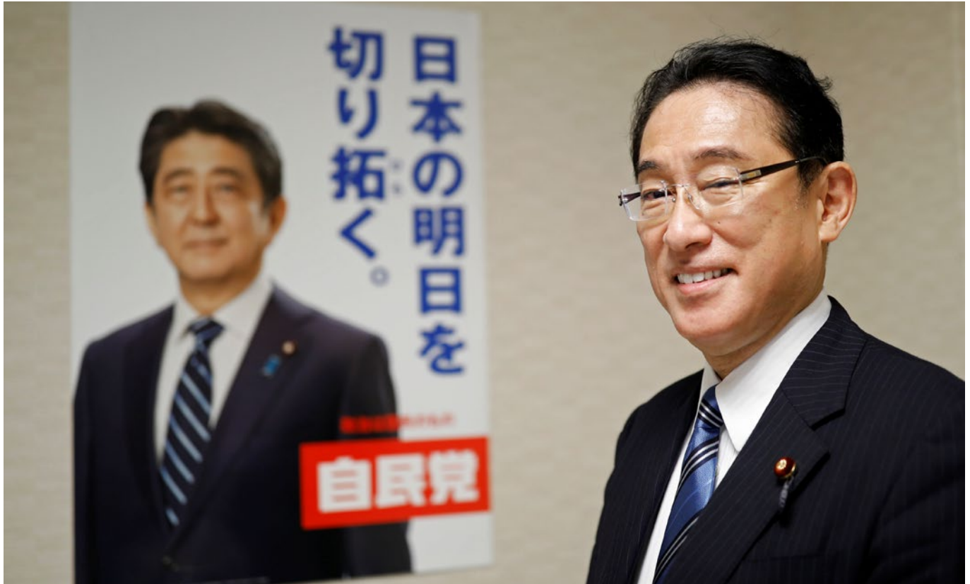
Pictured during his candidacy for the leadership of Japan's Liberal Democratic Party, Prime Minister Fumio Kishida poses in front of a poster of former prime minister Shinzo Abe (Tokyo, 2020).