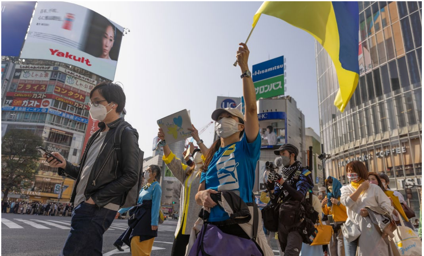
Japanese protestors march in central Tokyo to demand the end of Russia's war in Ukraine (Tokyo, 2022).