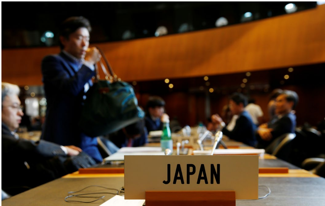
Members of the Japanese delegation arrive ahead of WTO dispute consultations between South Korea and Japan (Geneva, 2019).