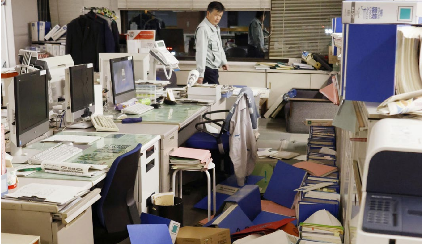
Files are strewn on the floor of the Hirono town office after a strong earthquake in Fukushima Prefecture (Japan, 2021).

still relies on outdated record keeping methods that could not keep up with cases.