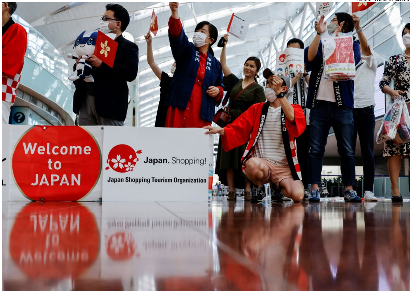
Members from Japan's shopping and tourism companies greet tourists from Hong Kong upon their arrival at Haneda airport (Tokyo, 2022).