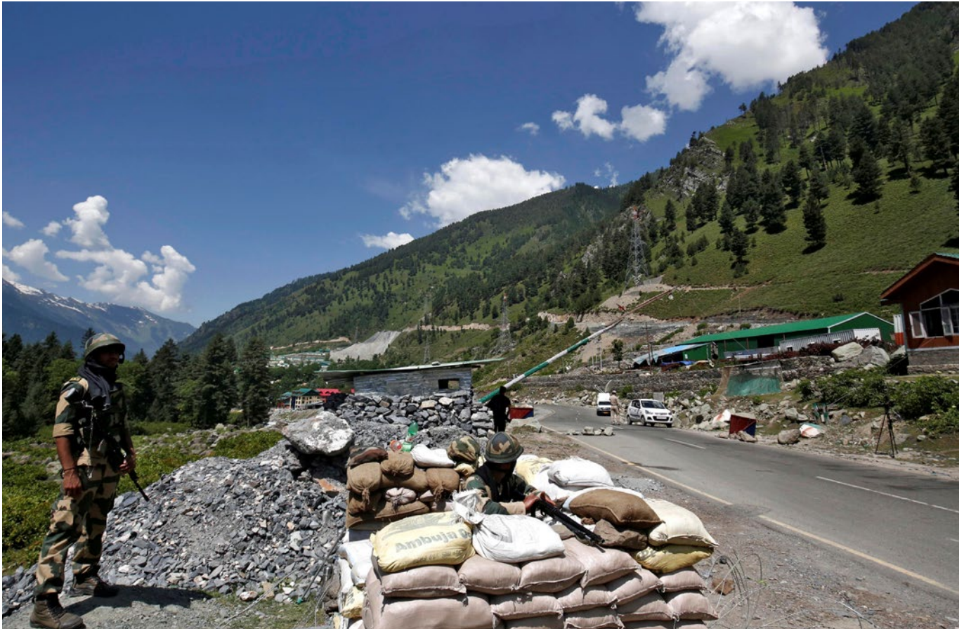
Soldiers from India's Border Security Force stand guard at a highway checkpoint leading to Ladakh on the same day that Chinese and Indian forces clashed in the Galwan Valley (Kashmir, 2020).

assist in the creation of its desired multipolar world where India is an independent and influential pole. But the geopolitical climate creates new risks and limitations for India,