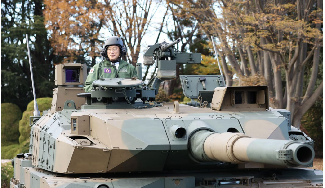
Japanese Prime Minister Fumio Kishida takes a ride in a tank during a visit to the Ground Self-Defense Force's Asaka base (2021).