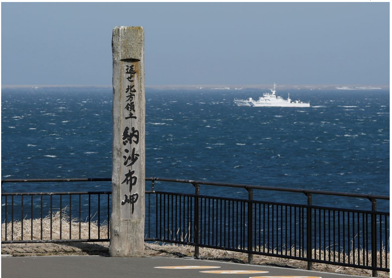
A Japanese Coast Guard vessel patrols the waters between Japan's easternmost point, Cape Nosappu, and the disputed islands of the Northern Territories and Southern Kurils. (Nemuro Peninsula, Hokkaido, 2017).