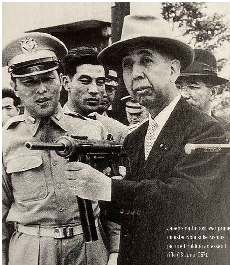
Japan's ninth post-war prime minister Nobusuke Kishi is pictured holding an assault rifle (13 June 1957).

Abe's most important innovation was to take Kishi's political program—which was tied to the exigencies of occupation and Cold War politics—and develop it into his own modern day battle slogan: 'overcome the post-war regime'. This meant revision of the US-imposed constitutional