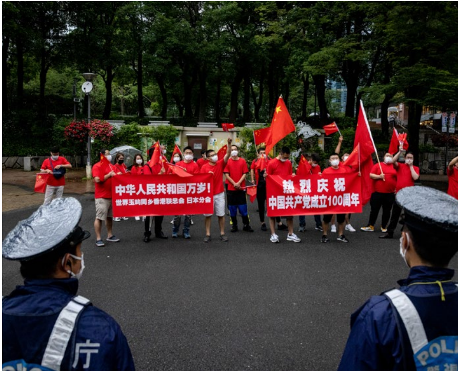
Pro-Beijing supporters gather to mark the 100th anniversary of the founding of the Chinese Communist Party and the 24th anniversary of Hong Kong's handover to China (Tokyo, 2021).