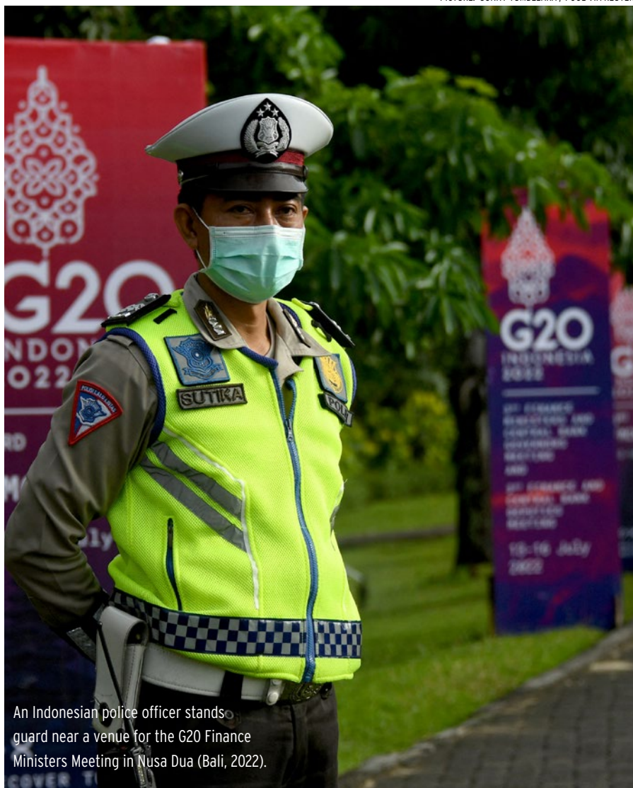
An Indonesian police officer stands guard near a venue for the G20 Finance Ministers Meeting in Nusa Dua (Bali, 2022).