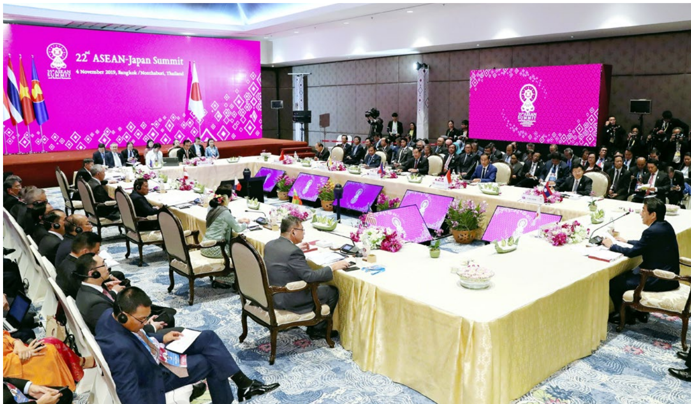
Japan's former prime minister Shinzo Abe addresses members of ASEAN at the 22nd ASEAN–Japan Summit in Bangkok (2019).

Economic Framework were launched. These efforts attempt to shape a favourable international environment with the United States at its centre. But they are not frameworks that can be used to collaborate with ASEAN or other non-US ally countries in Asia.