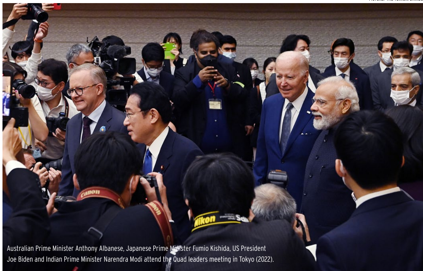
Australian Prime Minister Anthony Albanese, Japanese Prime Minister Fumio Kishida, US President Joe Biden and Indian Prime Minister Narendra Modi attend the Quad leaders meeting in Tokyo (2022).