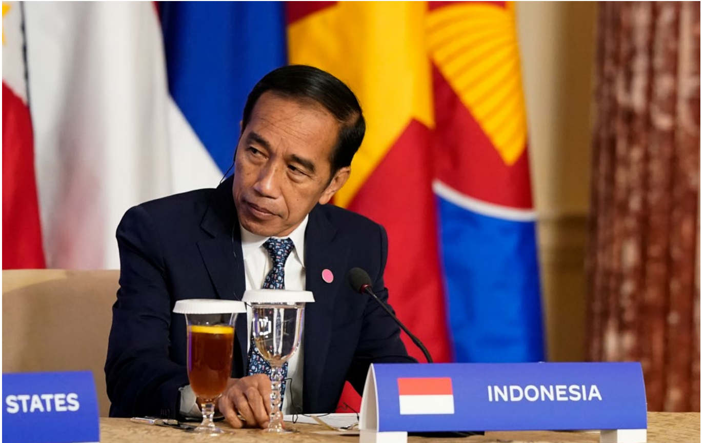
Indonesian President Joko Widodo listens as US Vice President Kamala Harris addresses the US–ASEAN Special Summit (Washington, 2022).