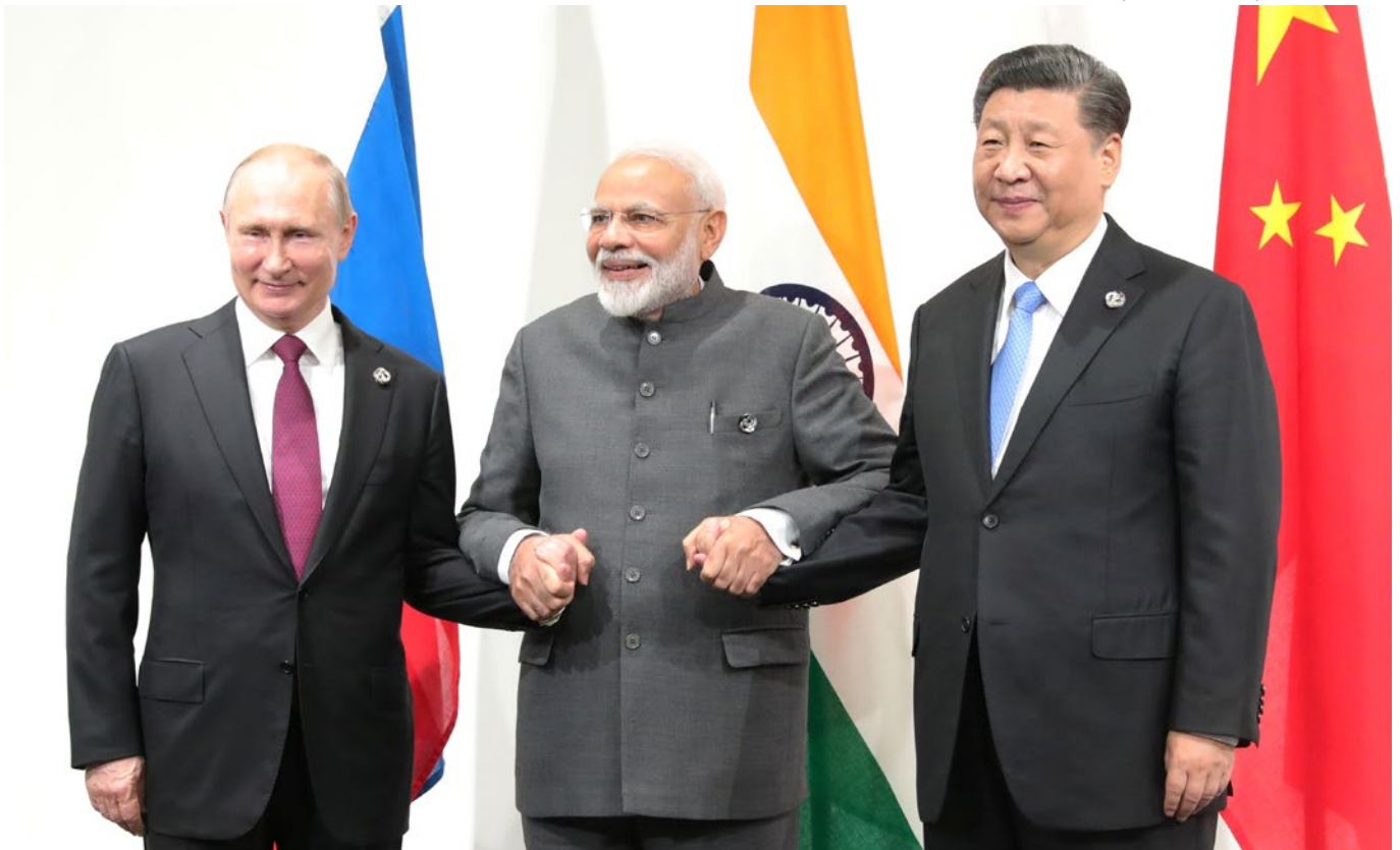
Russia's President Vladimir Putin, India's Prime Minister Narendra Modi and China's President Xi Jinping pose for a picture during a meeting on the sidelines of the G20 Summit in Osaka (2019).