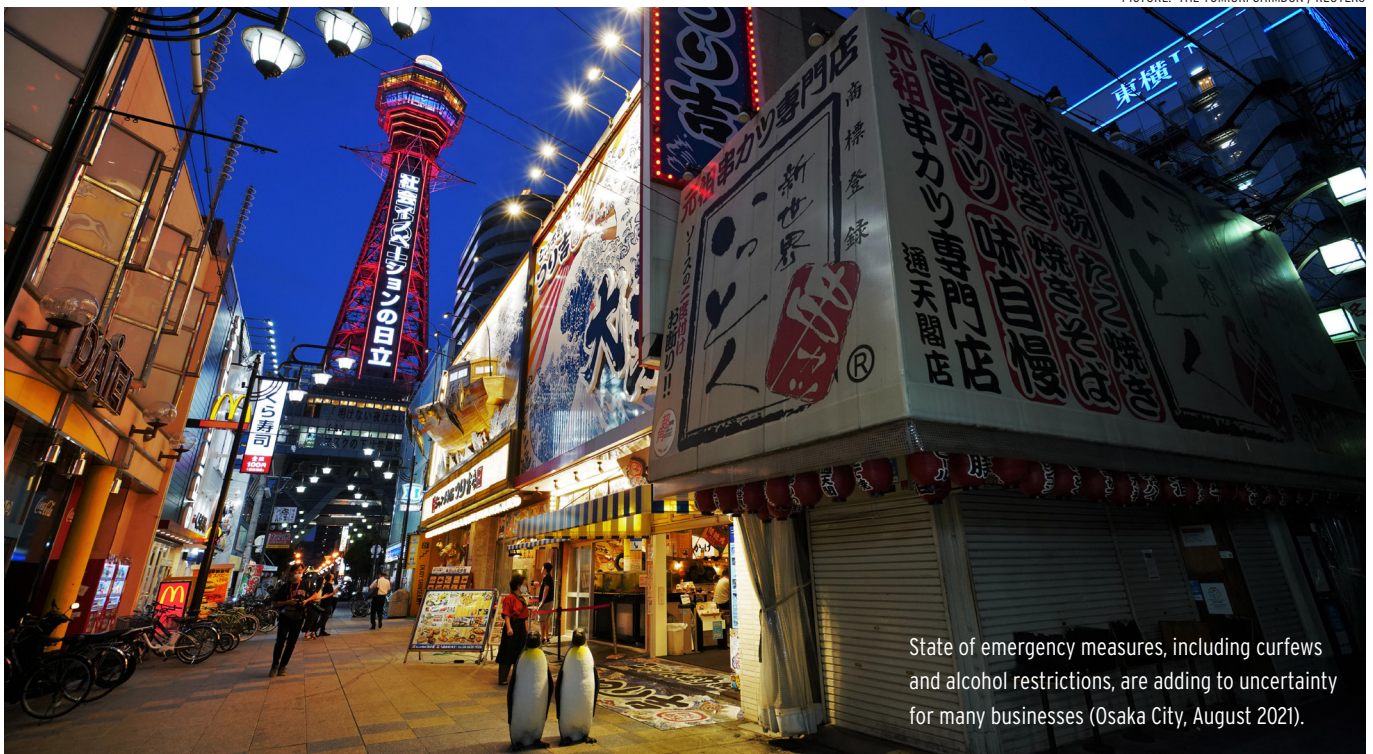
State of emergency measures, including curfews and alcohol restrictions, are adding to uncertainty for many businesses (Osaka City, August 2021).