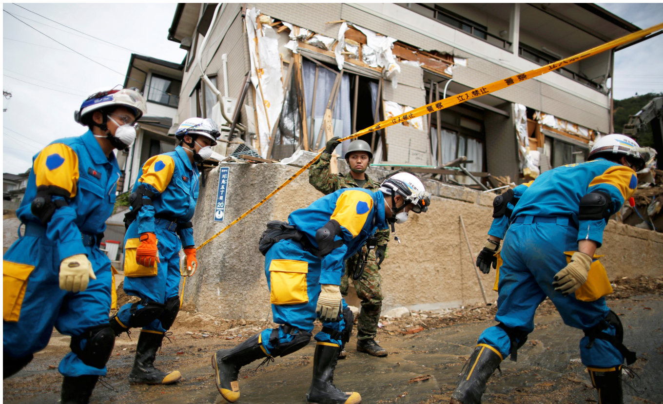
Rescue workers and Japan Self-Defense Force soldiers search for missing people at a landslide site in Kumano Town, Hiroshima Prefecture (July 2018).

message. The handbook stresses that rather than relying solely on the government to develop policies for disaster response, society as a whole needs to contribute to the development and promotion of measures ( jijo and kyōjo ).