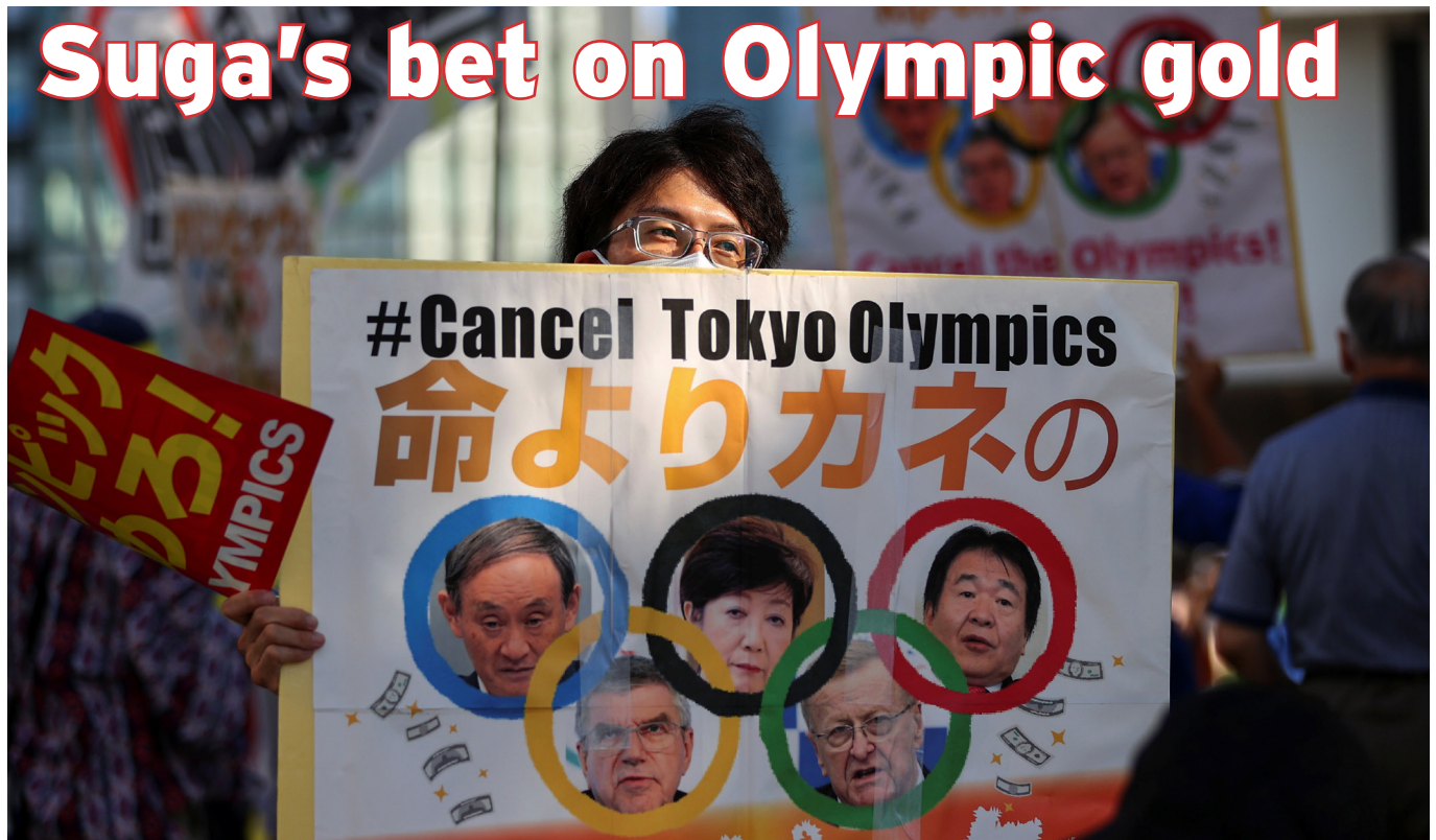
An anti-Olympics protestor displays a banner emblazoned with #Cancel Tokyo Olympics and The Olympics puts money ahead of human life (trans.) in Tokyo's Shinjuku district (August 2021).