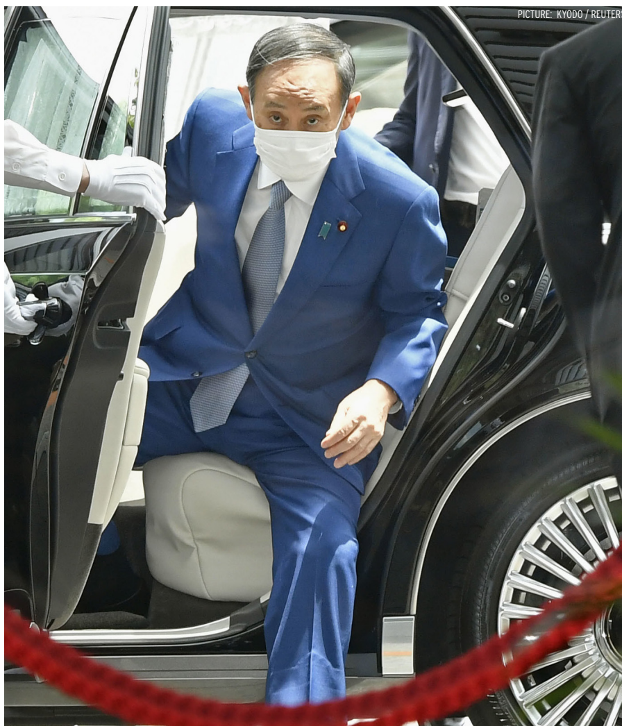
Prime Minister Yoshihide Suga has shown his credentials in the inverted universe of pandemic democracy.

With the prospect of a poor showing at Japan's general election, due by 21 October this year, it seemed a good idea to transfer power over to a steady hand. No one's hand could be steadier than that of Suga, who was the longest-serving chief cabinet secretary