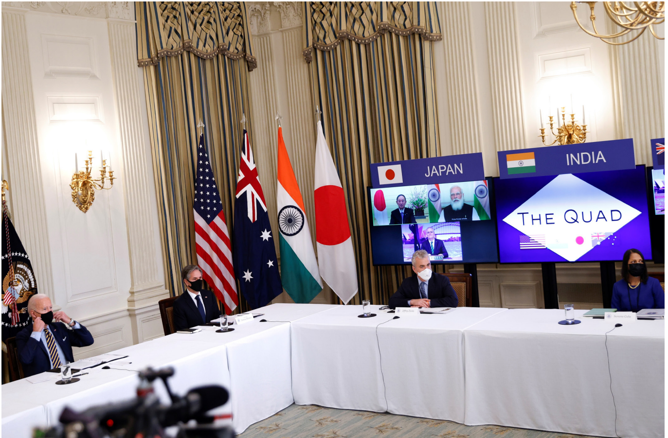
Members of the Quad are shown meeting for the first time at head of government level (March 2021).