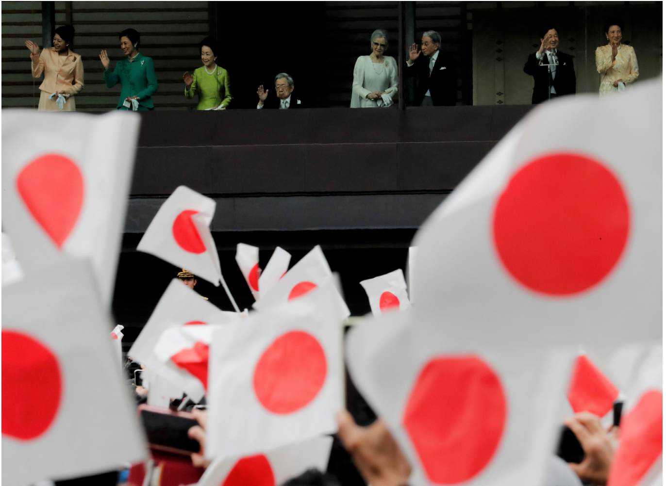
Japan's Empress Emerita Michiko, Emperor Emeritus Akihito, Emperor Naruhito, Empress Masako and royal families wave to well-wishers during a public appearance for New Year celebrations at the Imperial Palace in Tokyo (January 2020).

as a reproductive being struggling with the pressure to bear a male child. Because Japan, like so many other countries, consists of many dual-income families that embrace gender equality, the story of female sacrifice in the imperial family needs to change accordingly.