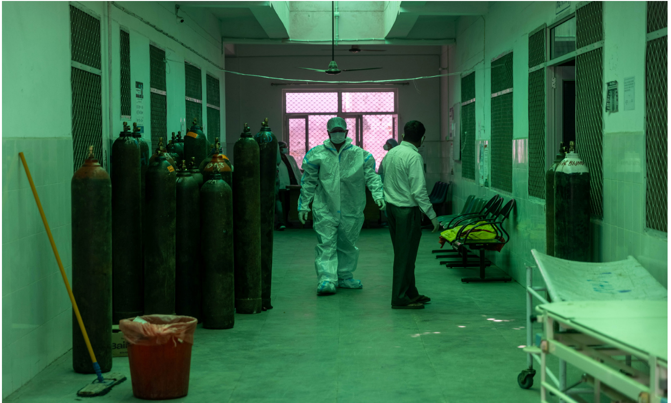
A healthcare worker walks past oxygen cylinders outside a government-run intensive care unit in the Bijnor district, Uttar Pradesh (May 2021).