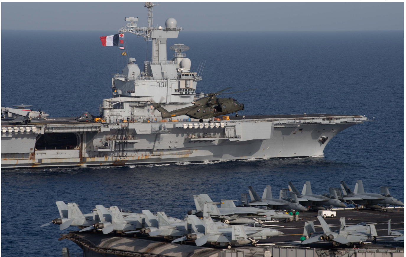
The French Marine Nationale aircraft carrier FS Charles De Gaulle and the US Navy aircraft carrier USS John C. Stennis underway in the Red Sea (April 2019).