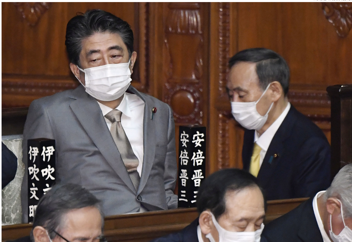
An overwhelming majority in the Diet guarantees success for LDP leaders such as Prime Minister Yoshihide Suga, and his predecessor, Shinzo Abe (January 2021).

in the appointment of key posts in specific agencies previously known for their well-entrenched independence, thus, placing them under political control. Particularly striking was Abe's violation of the independence of the Cabinet Legislation Bureau, which was forced to change its interpretation of Article 9 to pave the way for the enactment of security legislation.