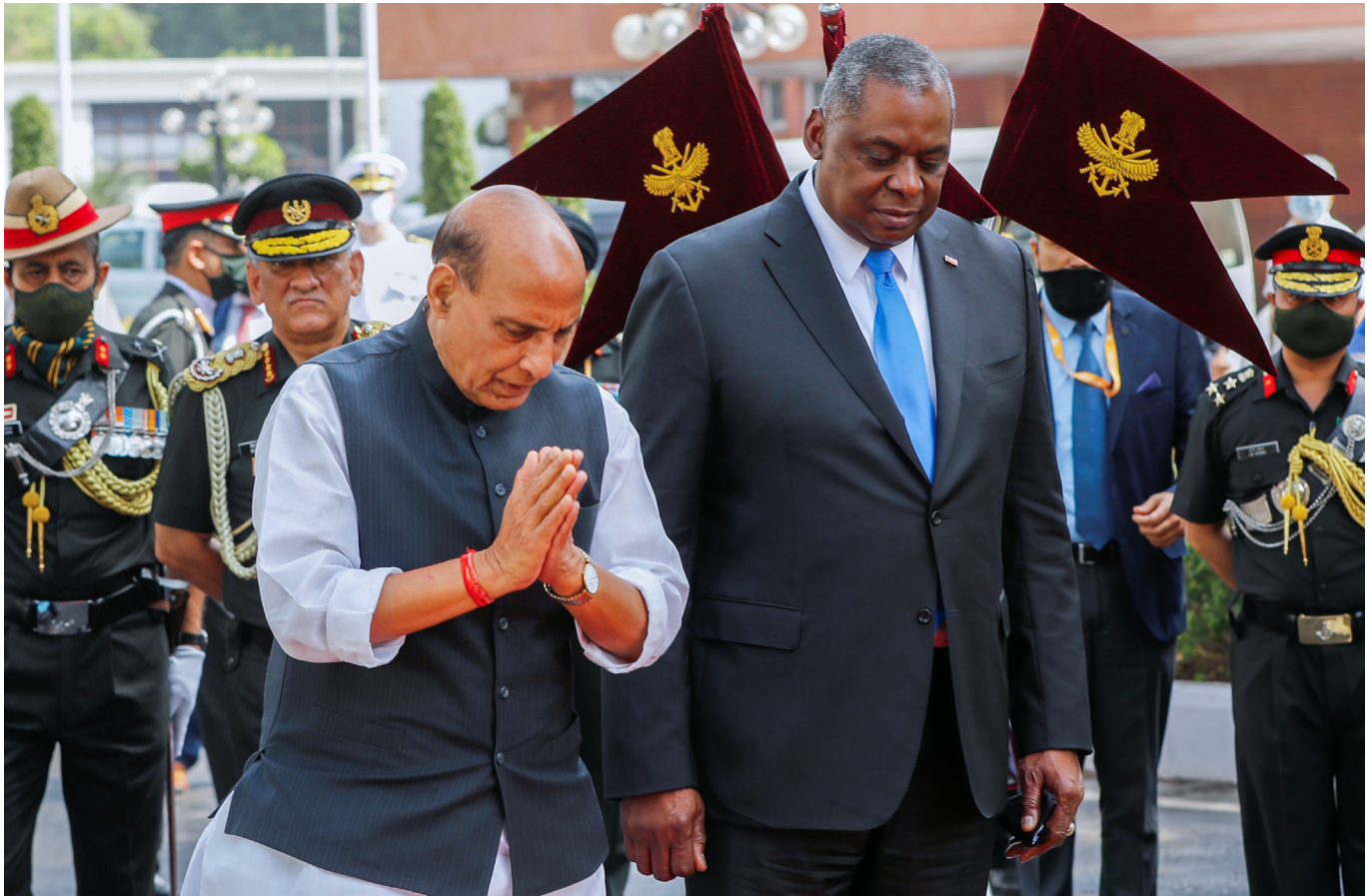
India's Defence Minister Rajnath Singh and US Secretary of Defense Lloyd Austin greet the media during a ceremonial reception in New Delhi (March 2021).

of statehood has been one of the most successful Western exports to this region. In this context, everyone jealously preserves their own interests. There is little commonality. It is deeply ironic that the one potential source of this is now fear of China. That is hardly a positive idea on which to build solid multilateral cooperation.