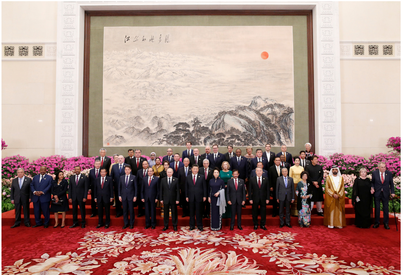
President Xi Jinping and other leaders gather before a welcoming banquet for the Belt and Road Forum at the Great Hall of the People in Beijing (April 2019).