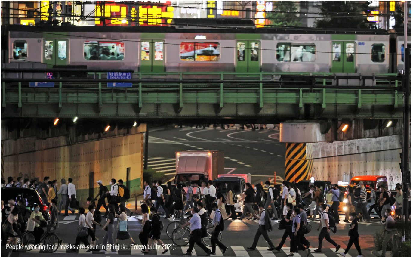
People wearing face masks are seen in Shinjuku, Tokyo (July 2021).