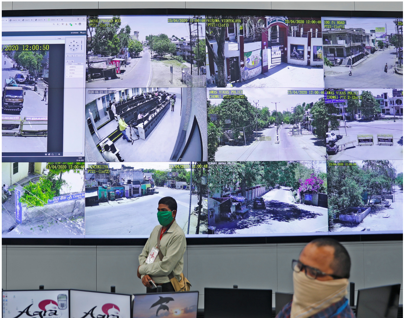
Officials work inside a control room to monitor the movement of people during India's initial nationwide lockdown to slow the spread of COVID-19 (Agra, Uttar Pradesh, April 2020).

the alacrity required to get the states on board for consultation, heeded experts and put up a purposeful response despite India's weak public health system and low state capacity. Effective central-state cooperation—largely steered by the federal leadership—helped India navigate the crisis with minimal fatalities. The second wave was, of course, a more infectious new variant that would overwhelm even most advanced healthcare system anywhere in the world. Yet, a more prepared federal government could have minimised