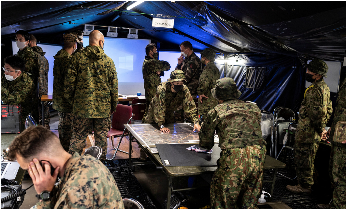
Japanese soldiers and US Marines train during a joint military drill held at Japan's Kirishima Exercise Area in Ebino, Miyazaki Prefecture (May 2021).