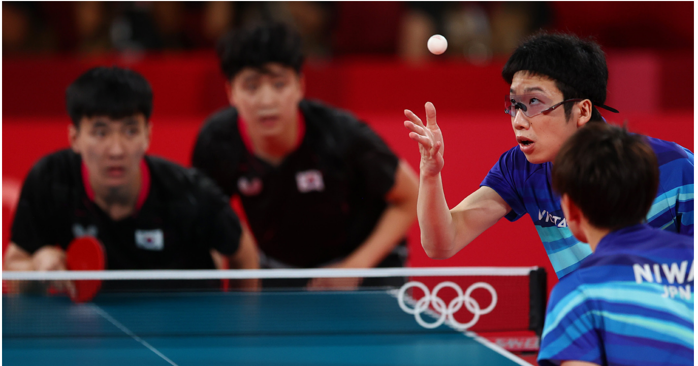
Japan and South Korea went head-to-head at table tennis for Olympic bronze (6 August 2021) but they will need to cooperate at the diplomatic table.