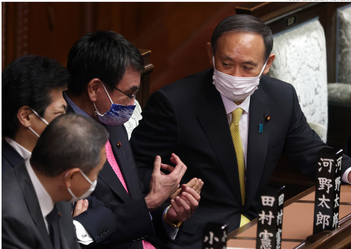
Prime Minister Yoshihide Suga speaks with cabinet members at a Lower House plenary session of the National Diet in Tokyo (11 May 2021).

There are two readily apparent constitutional claims available to Global Dining and other potential plaintiffs. The first is that Governor Koike's order improperly restricts constitutionally protected freedoms, including the right to do business. This claim is unlikely to succeed because the Diet holds the broad power described above and Japan's courts rarely overturn Diet action.