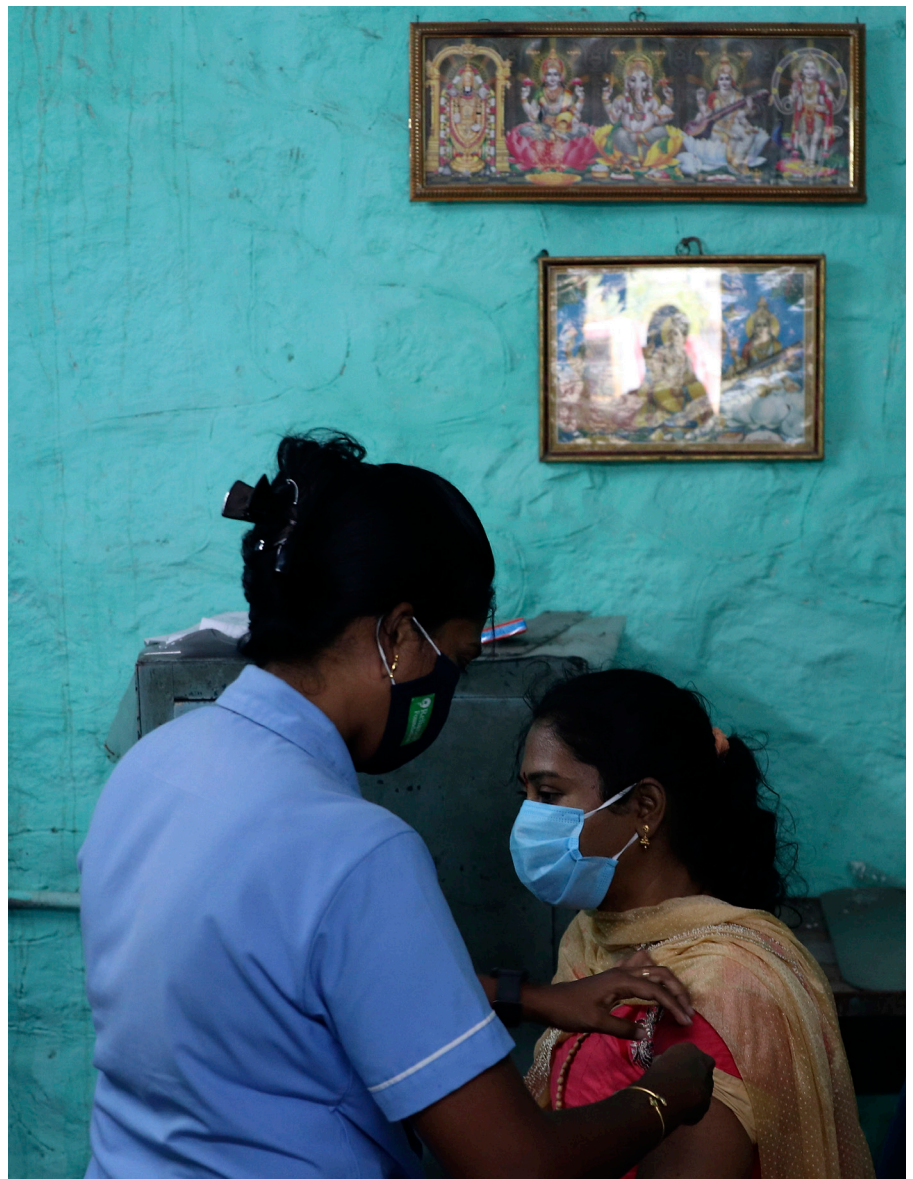
A woman receives the Covishield COVID-19 vaccine at a clinic run on school premises (Chennai, May 2021).