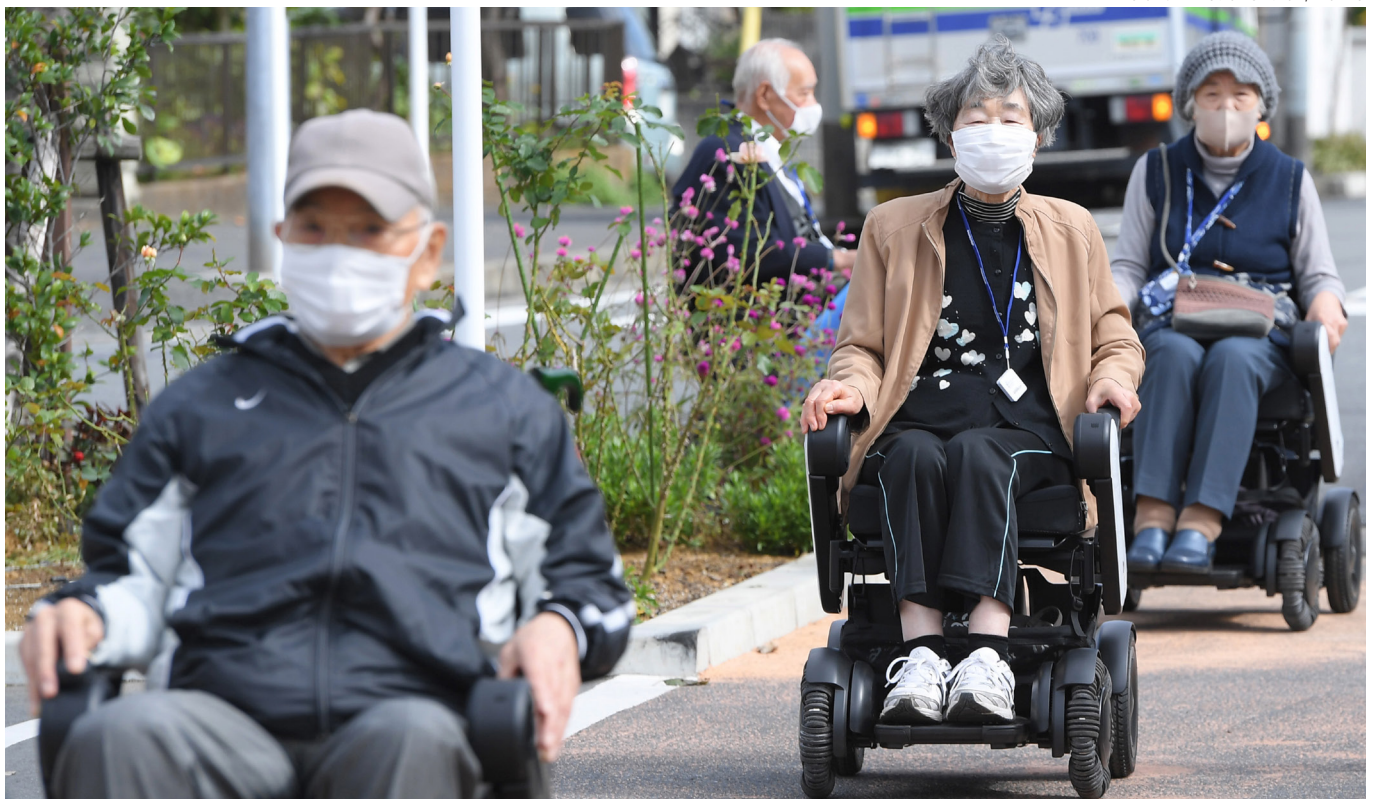
Japan has been declared the world's first 'super-aged' society with a birth rate decline that has been trending downwards since 1989.